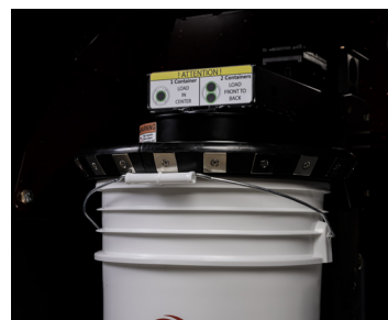
Magnetic pail catcher